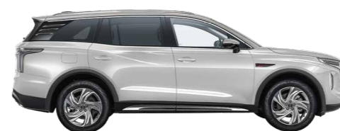
White (Body) +Black (Roof)