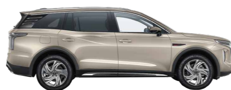
Golden (Body) +Black (Roof)