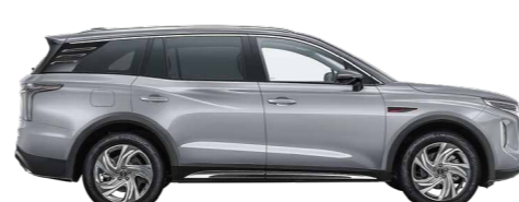
Gray (Body) +Black (Roof)